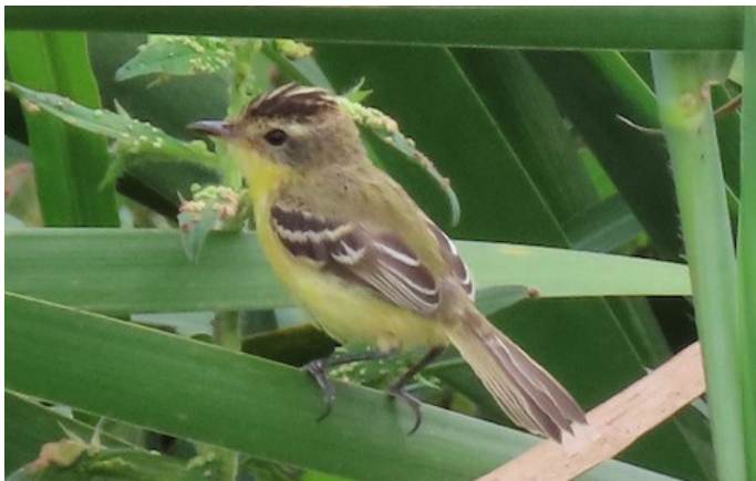
Fig. 8. Crested Doradito, Rahanut Trace, April 2023.

An adult female Crested Doradito Pseudocolopteryx sclateri was studied and photographed along Rahamut Trace on 3 April 2023 (SA, TA)(Fig. 8.). This is just the fourth documented sighting of this wanderer from mainland South America in the last 30 years, three of which have been from the same location.