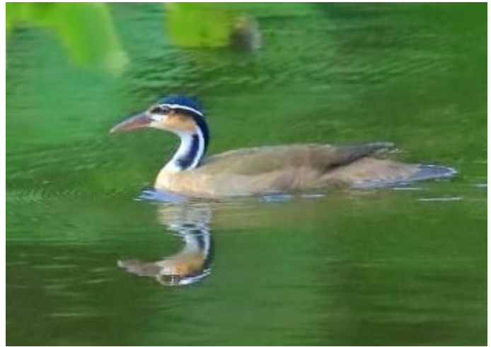
Fig. 1. Sungrebe, La Vega, October 2023.

For the seventh consecutive year, a Double-striped Thick-knee Hesperoburhinus bistriatus appeared on the Queens