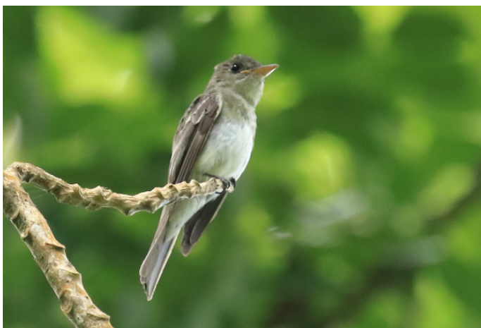
Fig. 9. Eastern Wood Pewee, Tortuga Shortcut Road, January 2023.

An Eastern Wood-Pewee Contopus virens was found within the cocoa plantation along Tortuga Shortcut Road on 4 January 2023, remaining until 27 March at least (NL) (Fig. 9.). What is assumed to be the same individual returned to exactly the same trees on 29 October and certainly still present up to 19 December (NL et al. ). Whilst visually extremely similar to Western Wood Pewee C. sordidulus , identity was confirmed by comparing the vocalisation of the two species. This is the first documented sighting for T&T of this migrant from continental North America.