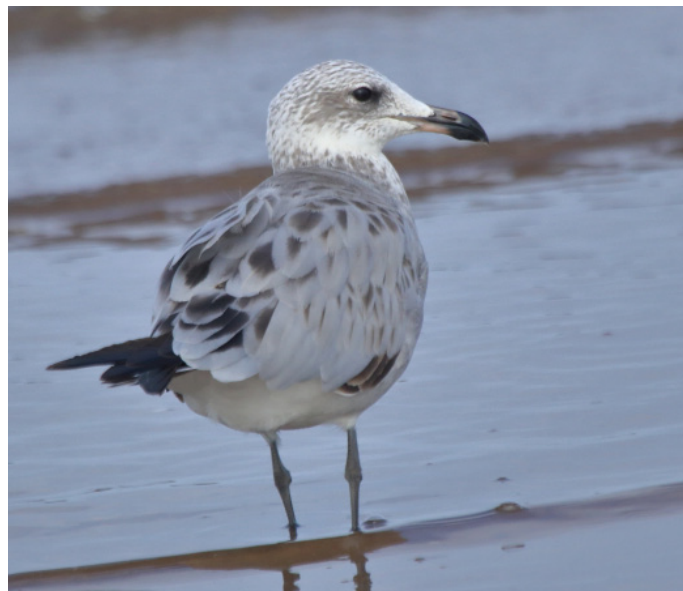
Fig. 5. Audouin’s Gull, Waterloo mudflats, December 2023.

In recent years, there have been several sightings along the coast of both Suriname and French Guiana. Nevertheless, the species is still regarded as Vulnerable by IUCN with its breeding population restricted to islands in the Mediterranean Sea and wintering off of coastal north-west Africa.