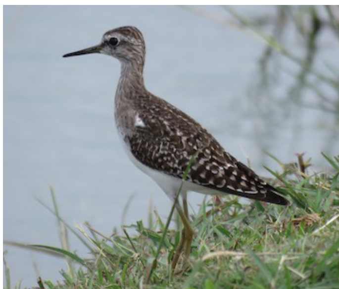
Fig. 4. Wood Sandpiper, Canaan, February 2020, Photo Matt Kelly.

A recent re-examination of historical photos of Tringa shorebirds has revealed the second documented sighting of a Wood Sandpiper Tringa glareola for Tobago, photographed at Centre Street ponds, Canaan on 17 February 2020 (MKe) (Fig. 4).