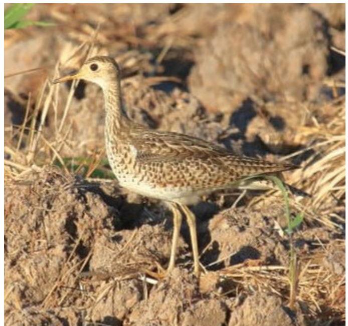
Fig.2. Upland Sandpiper, Caroni Rice Project, September 2023.

A total of seven Upland Sandpipers Bartramia longicauda were recorded during southbound migration as follows: one in farmland at Orange Grove on 3 September 2023 (JF); up to five birds on Caroni Rice Project intermittently between 16 September and 15 October 2023 (NL, MH, AS et al. ) (Fig.2.) with two birds seen again on 4 November. Elsewhere, one flushed from fields at Waterloo Secondary School on 21 October 2023 (NL).