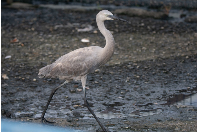
Fig. 6. Reddish Egret, Otaheite, November 2023.

A juvenile dark morph Reddish Egret Egretta rufescens was found at Otaheite Fish Market on 22 November 2023 (SS) (Fig. 6.) where it remained until the year's end. It was extremely confiding and anecdotally had been present for "several months". Whilst an uncommon resident to both the northern coast of South America and off-shore islands, this is just the seventh documented sighting for T&T in the last 28 years and the first since 2011.