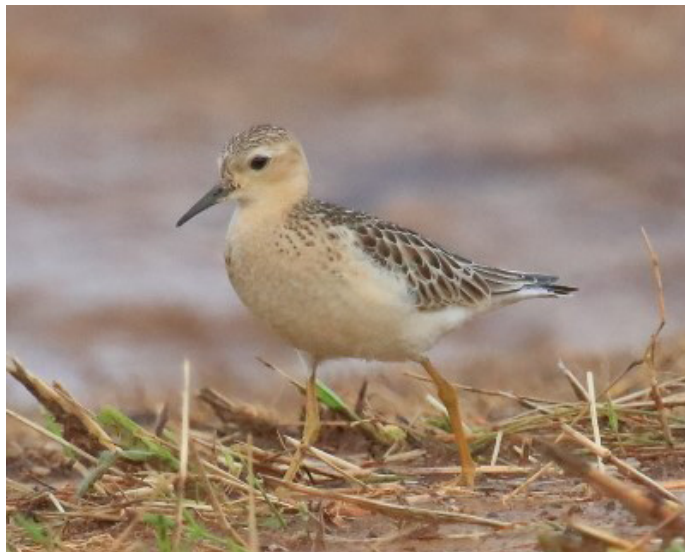
Fig. 3. Buff-breasted Sandpiper, Caroni Rice Project, September 2023.

At least 15 Buff-breasted Sandpipers Calidris subruficollis were found in wet, short grassy fields on Caroni Rice Project between 18 and 25 September 2023 (NL et al. ) (Fig. 3.). In addition, six birds were seen on Waterloo Secondary School fields on 21 October 2023 (NL). September and October remain key months for seeing this delightful “grasspiper”.