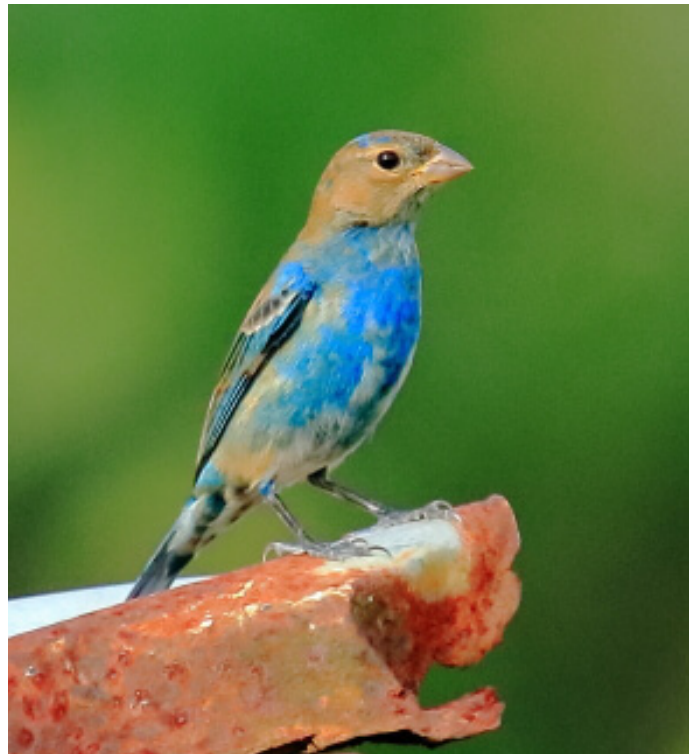
Fig. 11. Indigo Bunting, Aranguez, February 2023.

We are aware of a reintroduction project involving Muscovy Ducks Cairina moschata from Point-a-Pierre Wildfowl Trust. Sightings of this species from the south-west peninsula of Trinidad may involve birds from this scheme. Blue-and-yellow Macaws Ara ararauna frequently seen around the Queen's Park Savanna, Port of Spain and Festive Parrots Amazona festiva seen in Port of Spain and Champs Fleurs are assumed to be escapees from captivity. Village