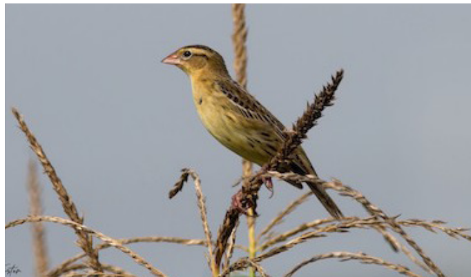
Fig. 10. Bobolink, Rahamut Trace, November 2023.

October and November are very much the key months to find Bobolink Dolichonyx oryzivorus in T&T. Two birds were photographed inside Caroni Rice Project on 14 October 2023 (NL) and five birds were seen along Rahamut Trace on 12 November 2023 (DH, RJ) (Fig. 10), four of which remained until 19 November at least.